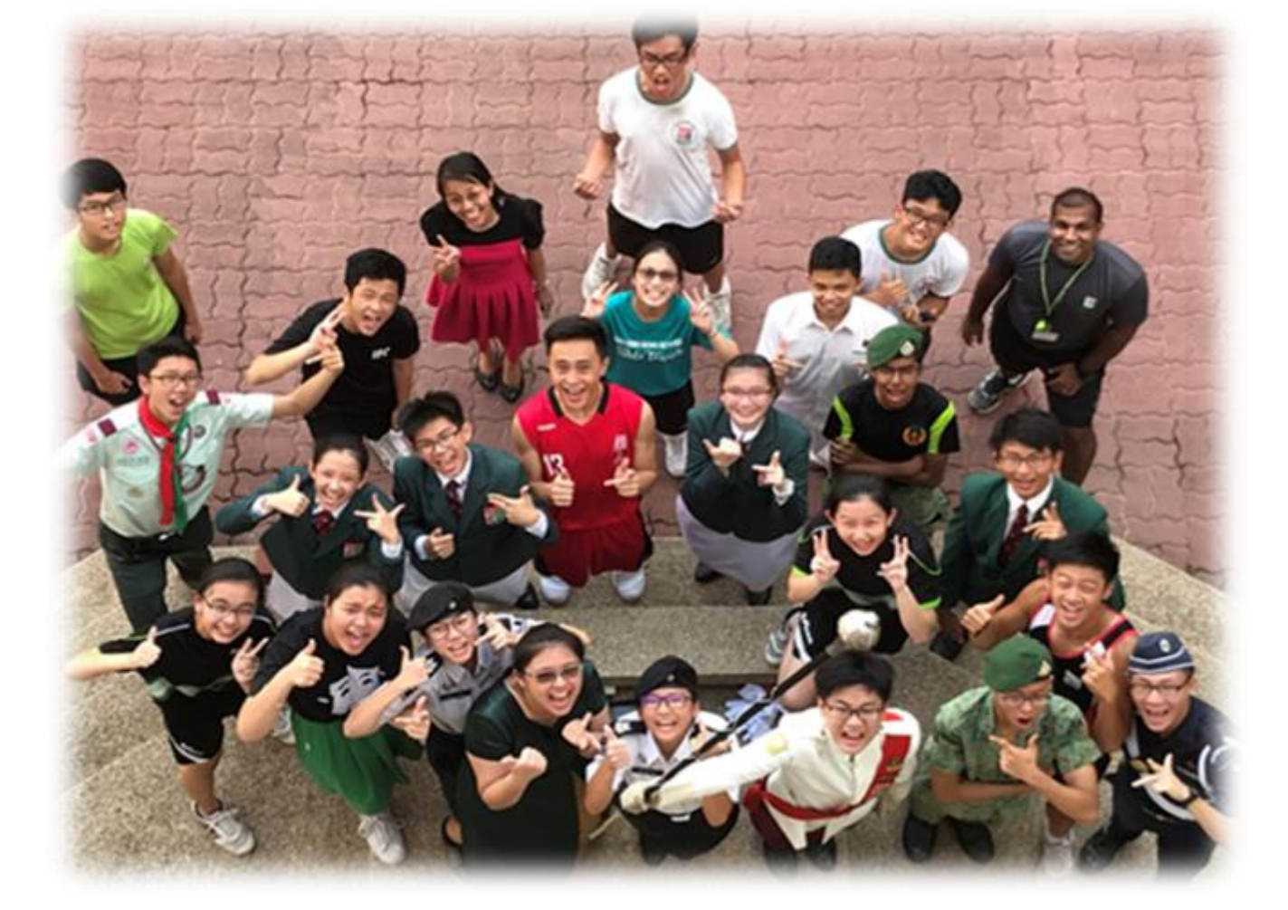
"Ten years to grow a tree, A hundred years to cultivate the person." - Chinese Idiom