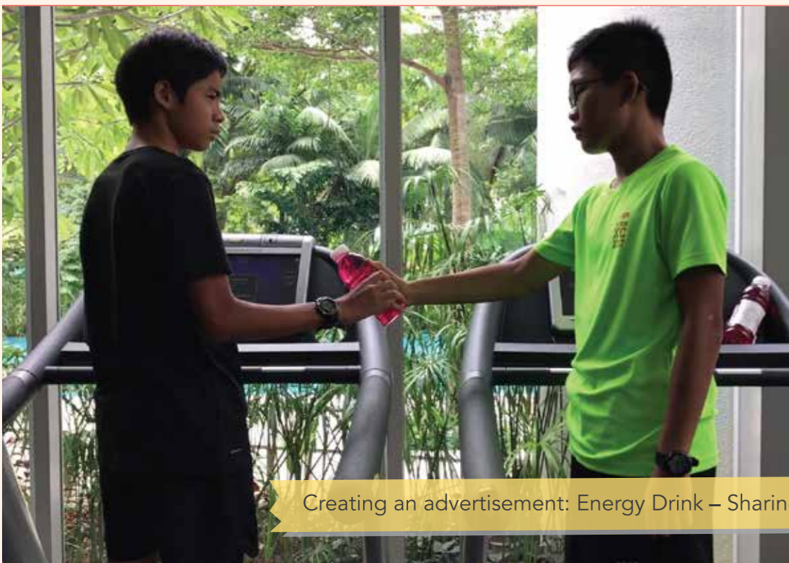
Creating an advertisement: Energy Drink – Sharing Among Competitors

Students gain an understanding of the persuasive techniques, language features and strategies used in advertisements. They synthesize this knowledge and produce advertisements of their own creation through collaborative work.