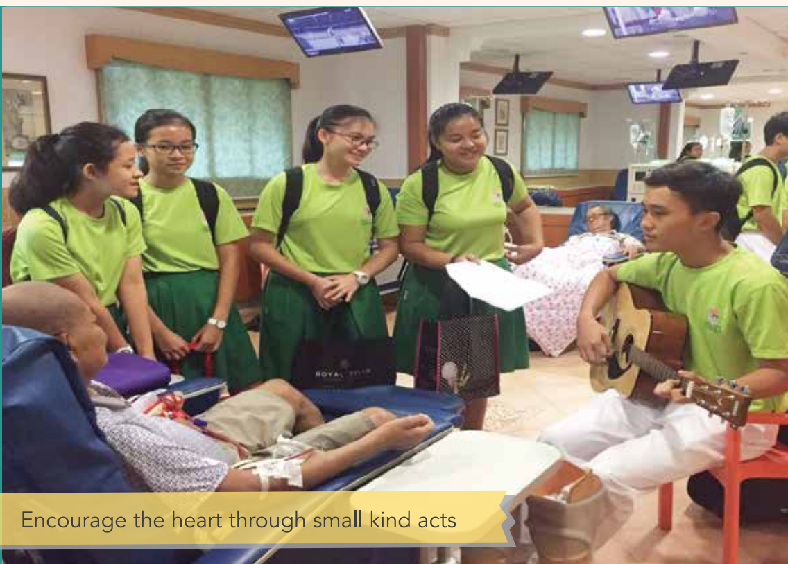
Encourage the heart through small kind acts