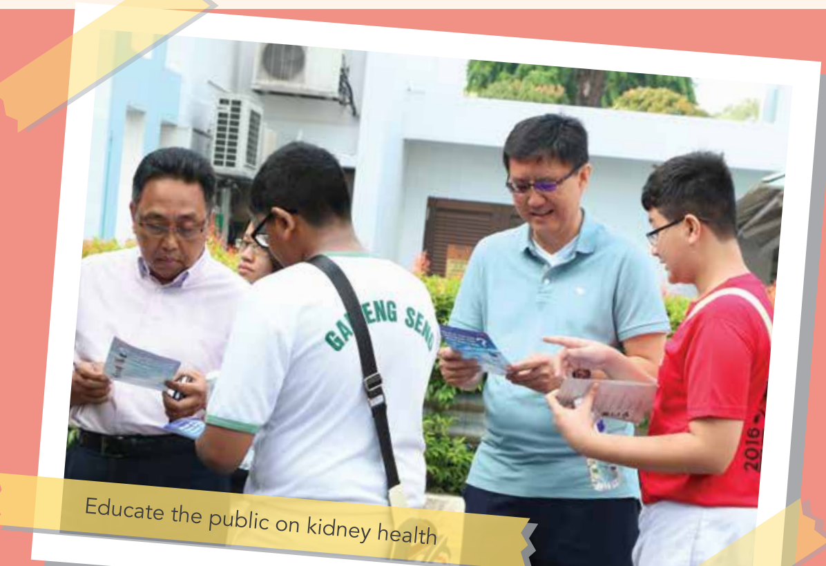
Educate the public on kidney health

Students will discover the uniqueness of individuals, learn to respect life and individuals, and accept one another's differences. They will build positive peer relationships, relate well with one another, live in harmony through learning how to resolve conflicts, influence one another to make a positive impact and support one another to succeed.