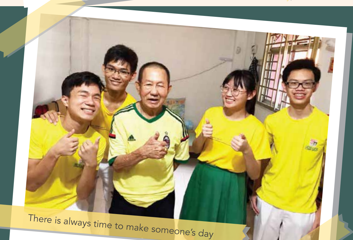
There is always time to make someone's day

Students will prepare themselves for the post-secondary phase and understand the demands of their future in areas of career, professionalism, relationship, marriage, and parenting. They will develop life skills, confidence and resilience to embrace the future ahead, and pursue their aspirations by anchoring deeply in values.