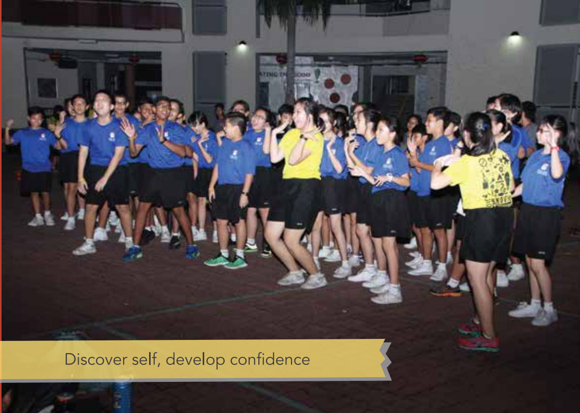
Discover self, develop confidence