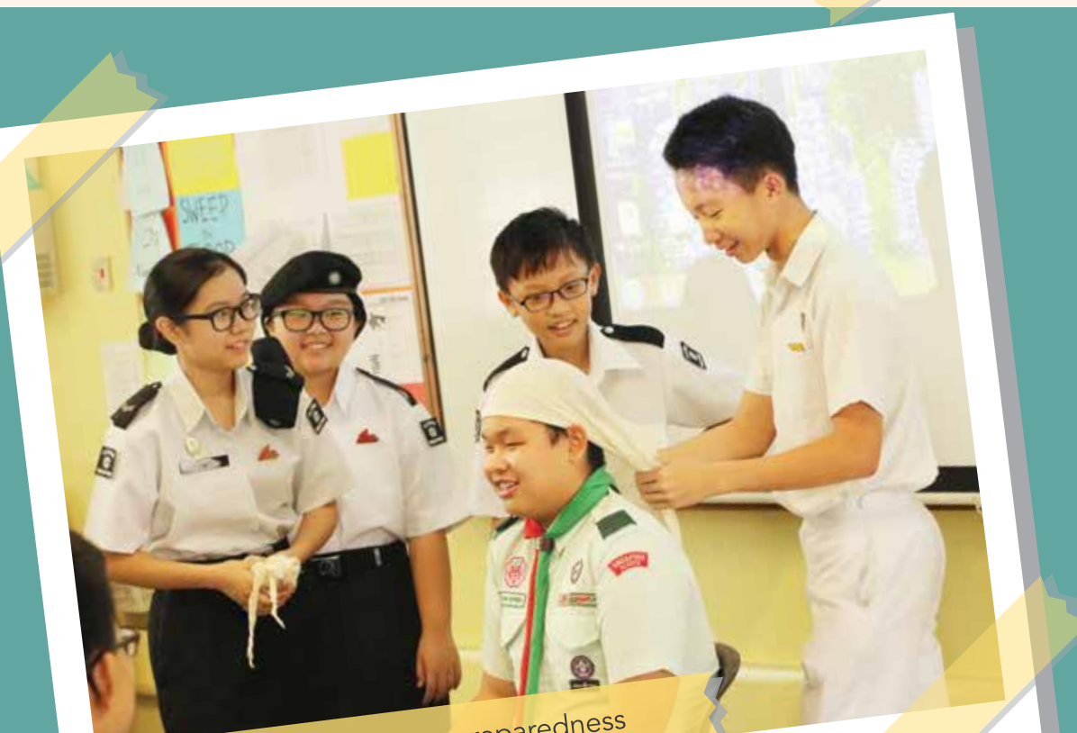
Train peers on emergency preparedness

Students will understand the need to take on greater roles and responsibilities to lead self and others. They will build up resilience in managing complexities and overcome life challenges. They will be involved in responsible decision making to make good informed choices to make a positive difference in family, school, and the community.