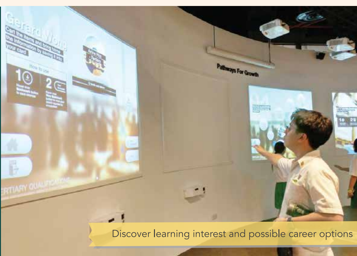
Discover learning interest and possible career options