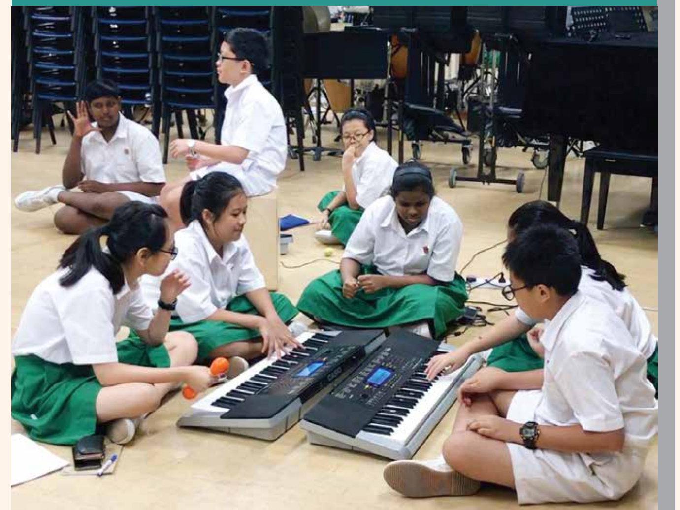
Sec 1 students performing their compositions in music lesson

In Music, students hone their musical skills through singing and playing of music instruments in an informal group setting. They get to create and perform their own compositions and pop song covers. Different talents are celebrated through public performances during Aesthetics Week and GESS Piano Competition.