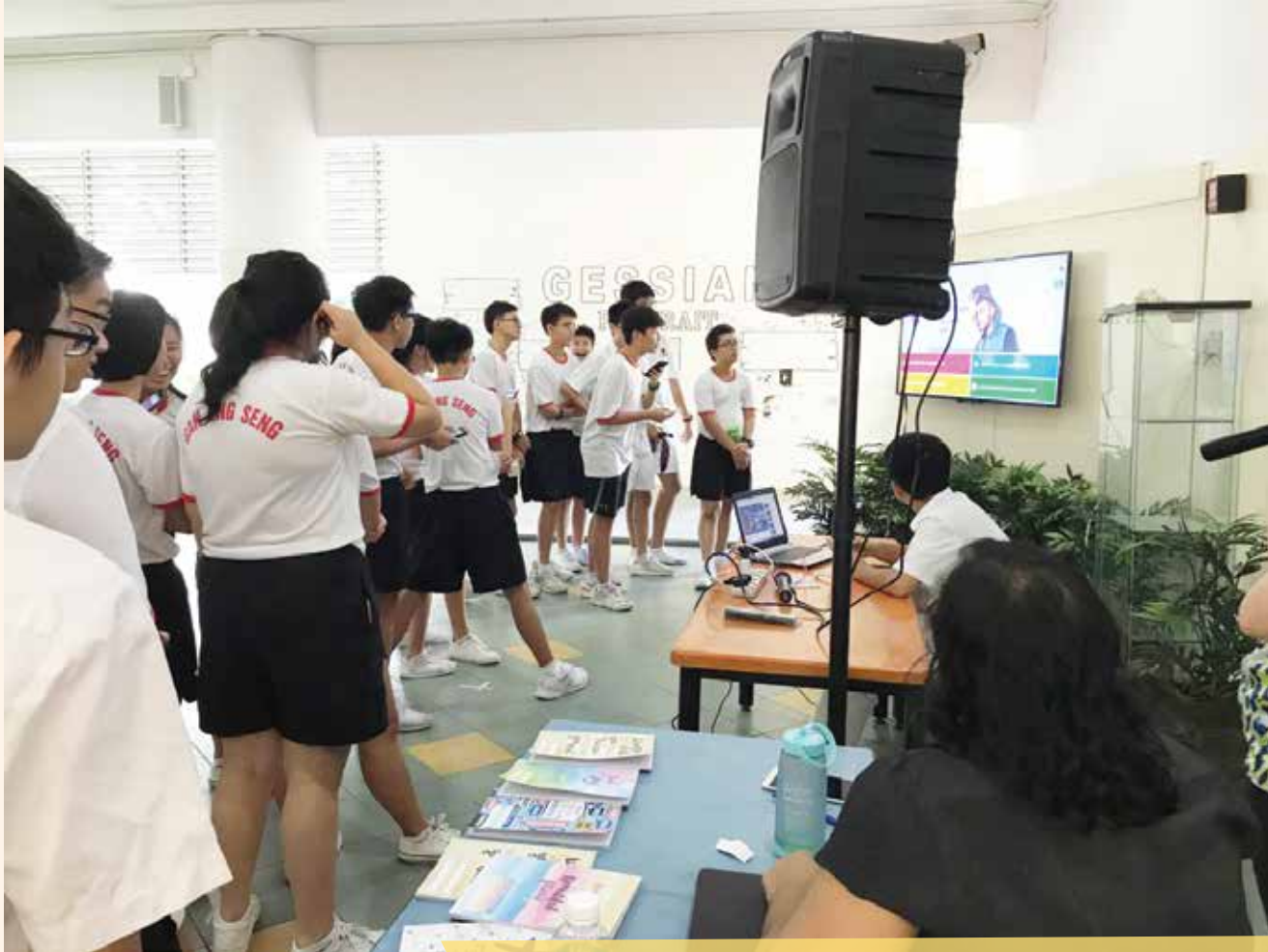
Students playing Kahoot Trivia during Aesthetics Week

Aesthetics Week, held at the end of Term 2, allows GESSians to experience and participate in various artforms. The Aesthetics Week programme helps generate school-wide interest in various facets of the arts, such as Dance, Drama, Music, Visual Arts and Literary Arts.