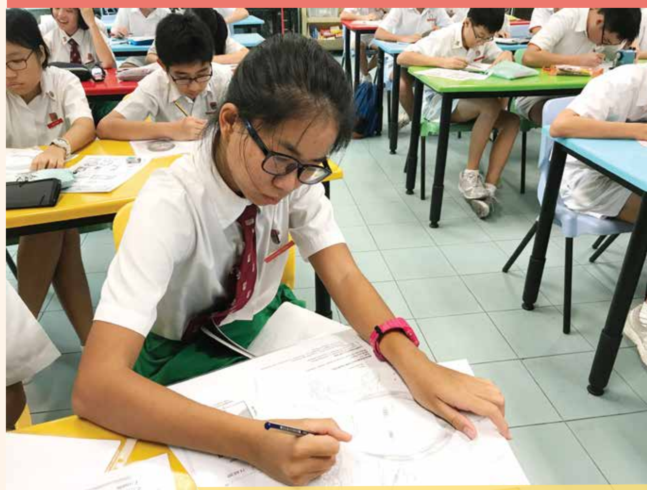
A Sec 2 student expressing herself through her self-portrait

In Art, students explore artistic means of expressing themselves using a variety of media such as drawing, painting and digital photography. Beyond making art, students learn from artists and artworks through learning journeys to art exhibitions. During the Aesthetics Week, students also get the opportunity to showcase their artworks.