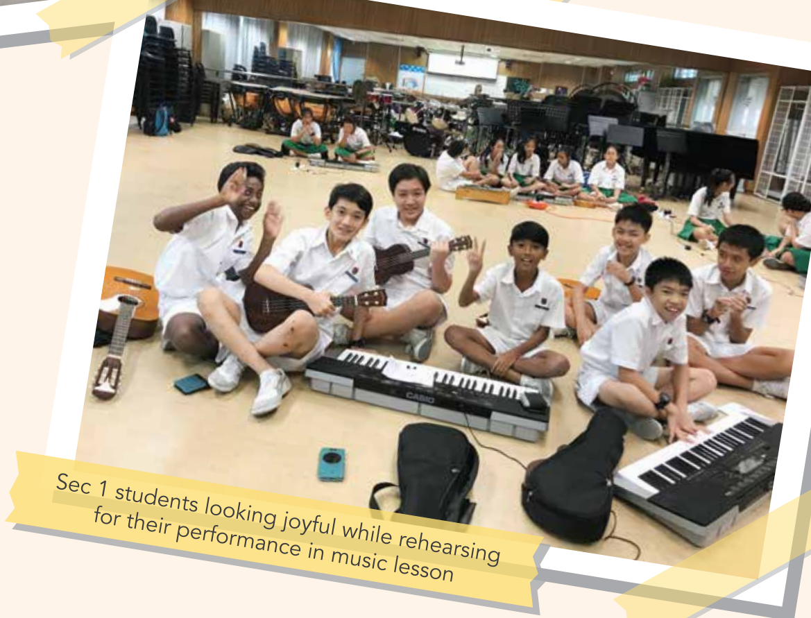
Sec 1 students looking joyful while rehearsing for their performance in music lesson