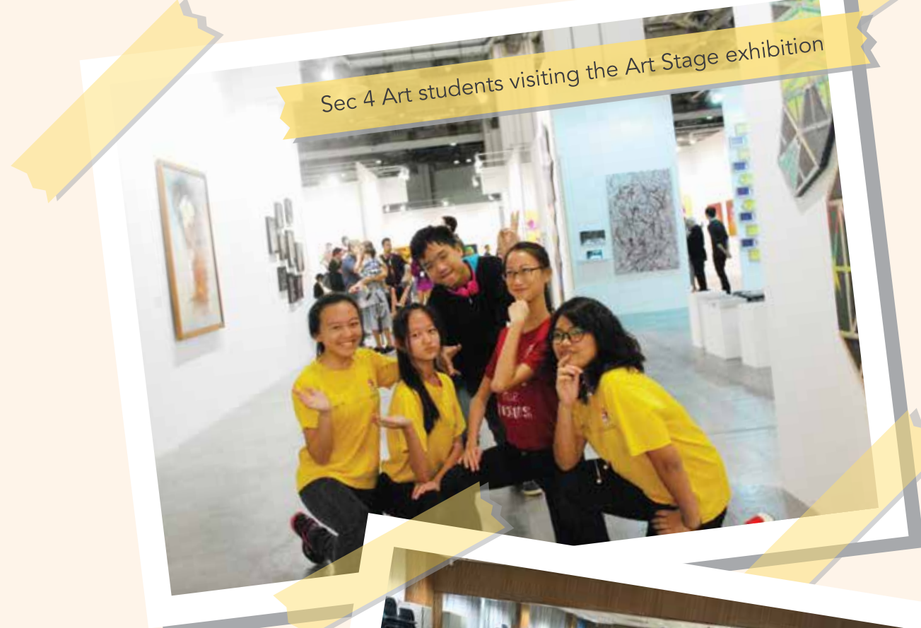
Sec 4 Art students visiting the Art Stage exhibition